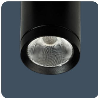
Wide optic - 37° beam