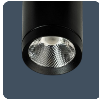
Narrow optic - 26° beam