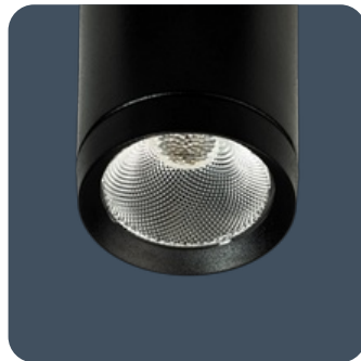
Flood optic - 53° beam