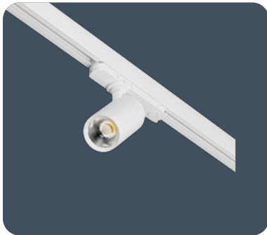
Track mounted non-dimming in white