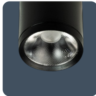
Narrow optic - 22° beam