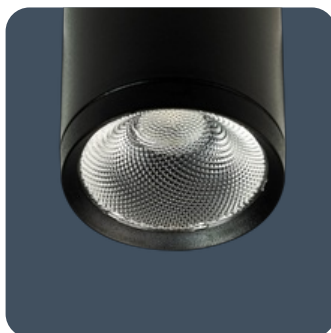
Flood optic - 54° beam