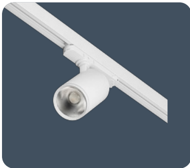
Track mounted non-dimming in white