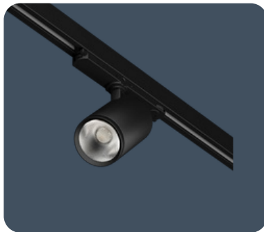
Track mounted DALI dimming in black